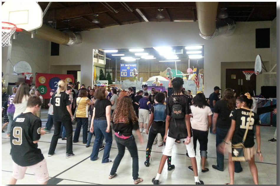
Dancing at the St. Michael's Back-to-School Dance

On November 2nd, members will volunteer in the registration, survivor check-in, and hydration station booths at the Heart Walk to support the American Heart Association. On November 4th, SNA will host a bone marrow drive, which can help people with life-threatening blood cancers like leukemia and lymphoma. On November 8th, volunteers will help with serving food and a silent auction at the Magnolia School's Moonlight on the River Gala. The Magnolia School serves adults with intellectual and other developmental disabilities. This event will help to raise money to support the school's services. During the month of November, donations will be collected for the Magnolia School.