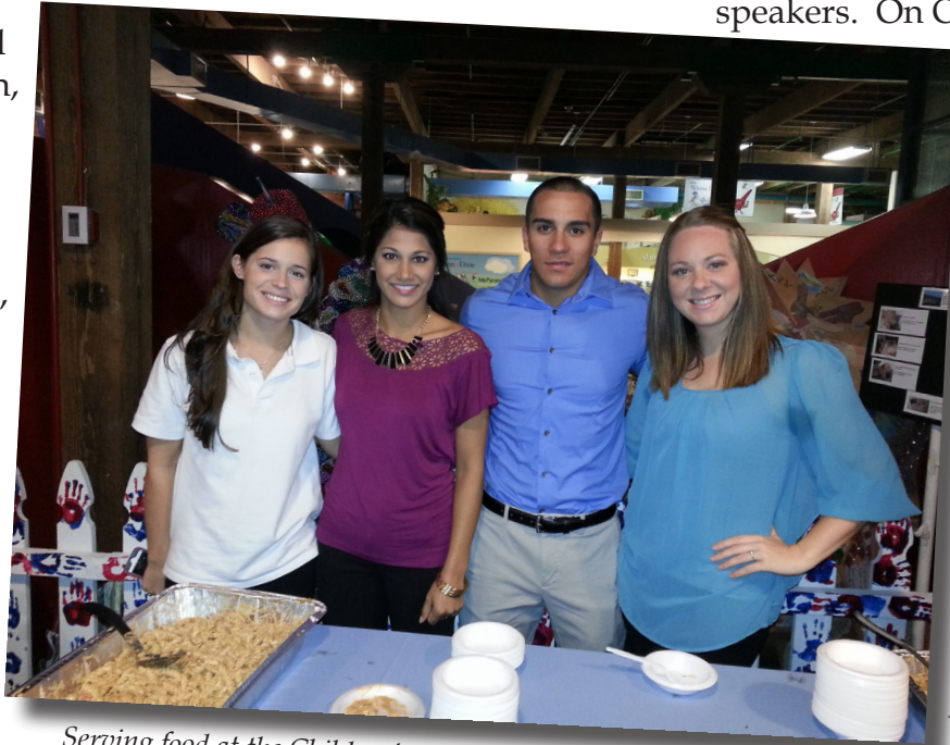
Serving food at the Children's Museum CHAIRish the Children Gala

With the fall semester in full swing, the Student Nurses Association (SNA) has already participated in several community service events. On August 24th, volunteers joined the Louisiana Children's Museum during their annual fundraising CHAIRish the Children Gala. SNA members helped with the setup, food service, auction, and cleanup. On August 26th, SNA partnered with The Blood Center to host a blood drive on campus. To finish up the month of August, SNA hosted a sports-themed back-to-school dance for St. Michael's Special School, which serves children and adults with special needs. On August 30th, thirty-nine volunteers helped to set up St. Michael's gymnasium in preparation for the event. On August 31st, thirty-one volunteers assisted during the dance. Eighty-two St. Michael's students were in attendance, and they all had a blast. The students showed off their dance moves, played bean bag toss, and participated in the limbo! Donations were also collected for this event throughout the month of August, as decorations, prizes, and food were needed to be able to host the event.